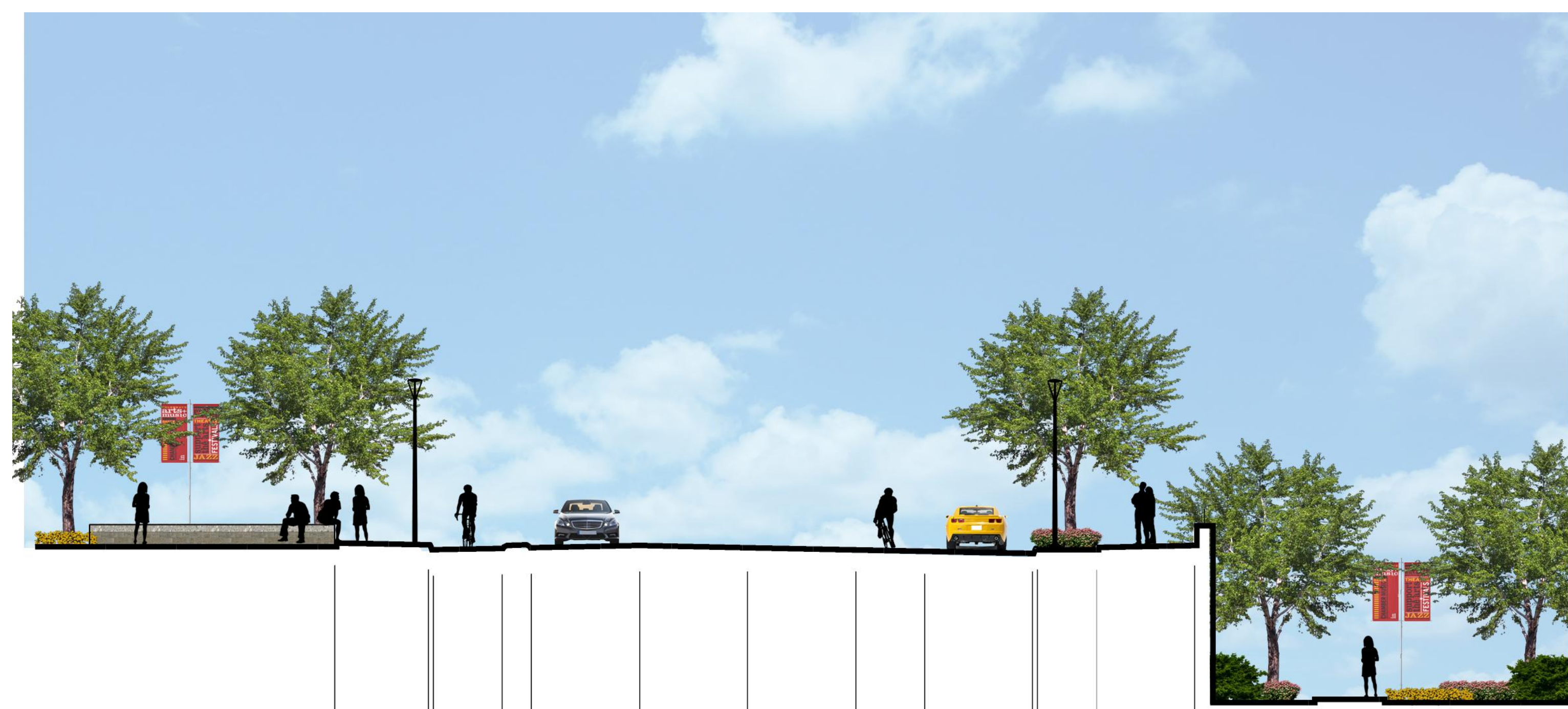
A SECTION A-A